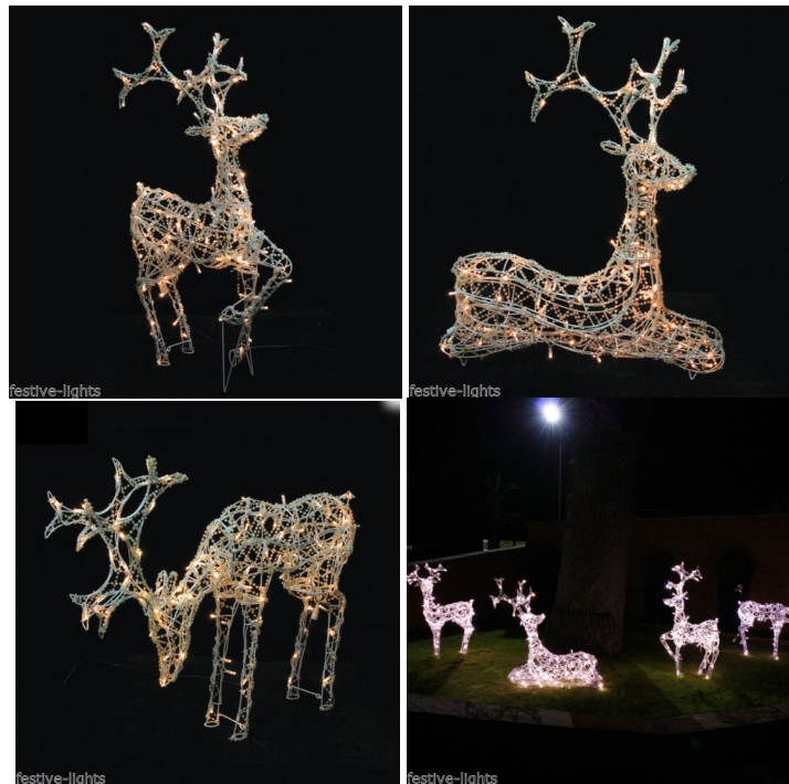
LED 3D EATING/STANDING/RUNNING/LYING REINDEER BEADED CHRISTMAS LIGHT (H: 1.1m)