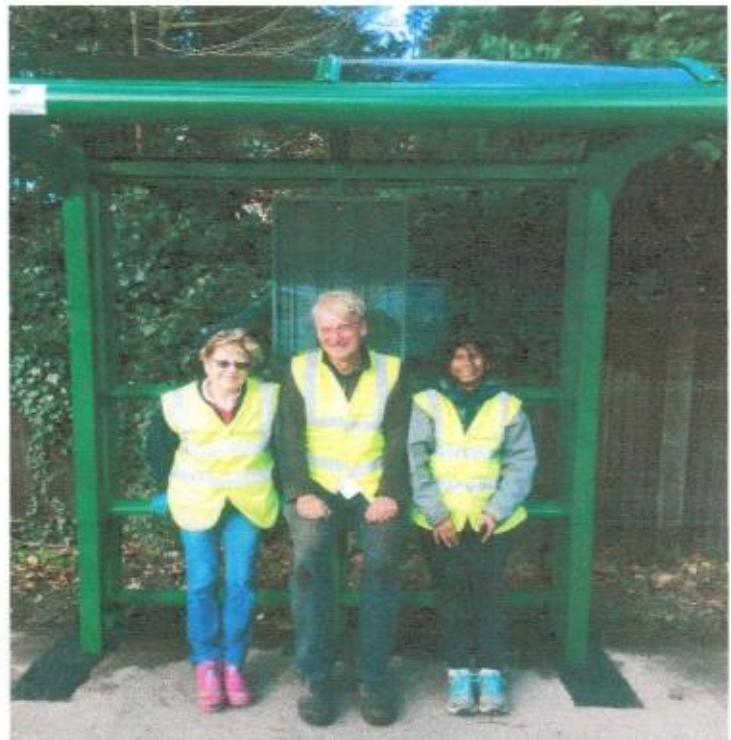
Sunningdale Parish Councillors enjoying their new shelter

"Everything was done to an extremely high standard; the fitting team were both very friendly and efficient. A job very well done!" – Sunningdale Parish Council