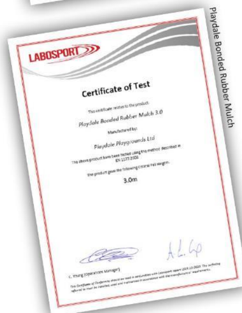
Playdale Bonded Rubber Mulch