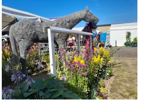
Examples of Wire & wool