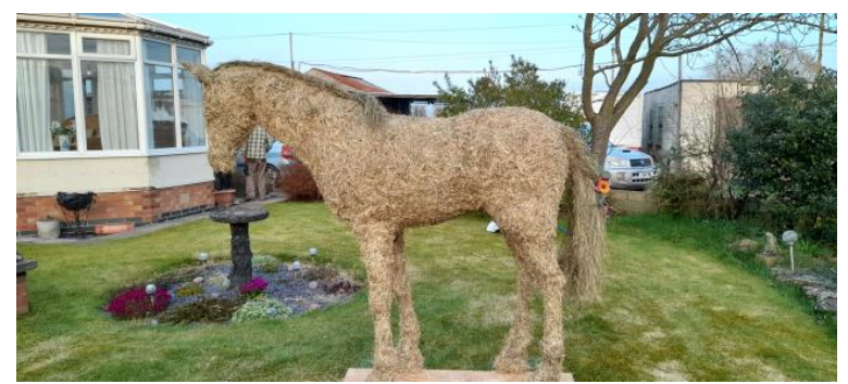
Example of Hay & wire