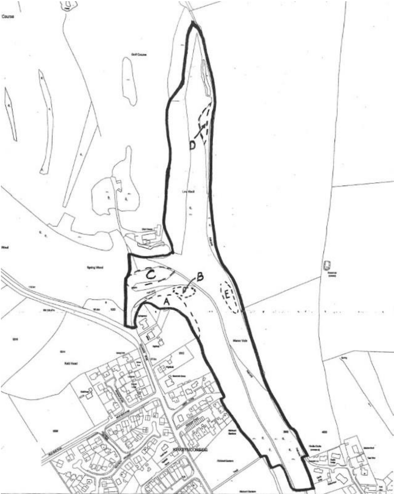
MAP 2: FEATURES REFERRED TO IN THE MANAGEMENT PLAN