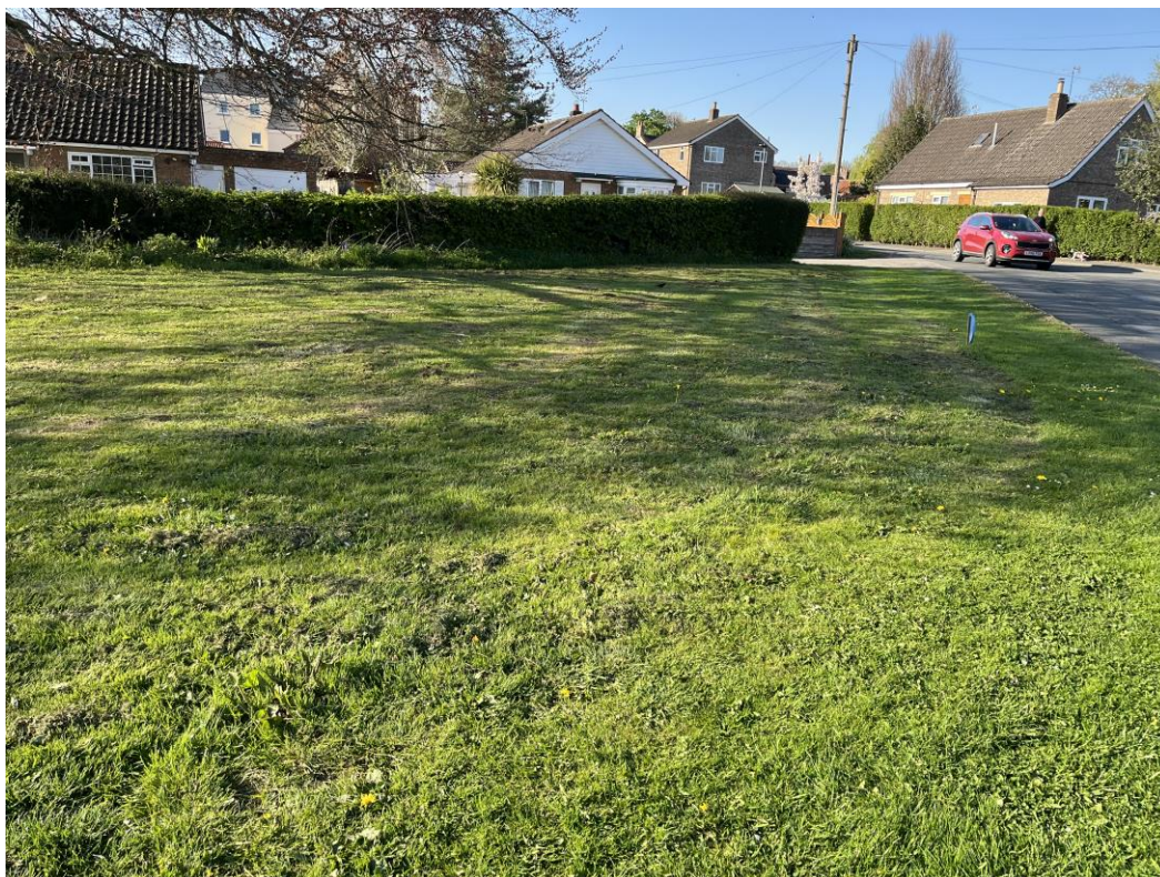
Picture above: May 2025 area of verge at junction of West Lund and A170 returned to original grass cutting schedule.

Each of the areas will be cut once in the spring, and all arisings collected, and then be left uncut until the end of September when the final cutting exercise will be carried in the same way as hay making, again with all arisings removed. In each of the designated wildflower areas the compulsory 1m safety strip will be mown frequently, as appropriate. Agreed.