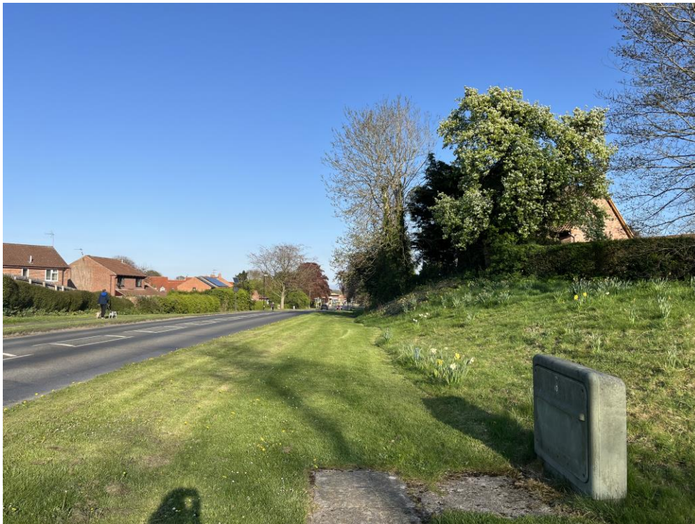
Photo above: Taken from junction of West Lund Lane and A170 facing east along A170

Response: The contractor has explained that along the length of the A170 east of the junction at West Lund Lane a path has been created by pedestrians on the verge. The concern was that by reducing the width of the cut area along the A170 pedestrians would be encouraged to walk closer to this busy road, which would not be safe.