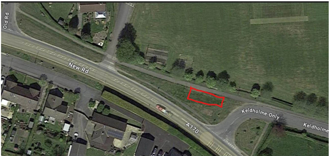
Proposed new location of the Memorial Bench outside the sports field on A170.