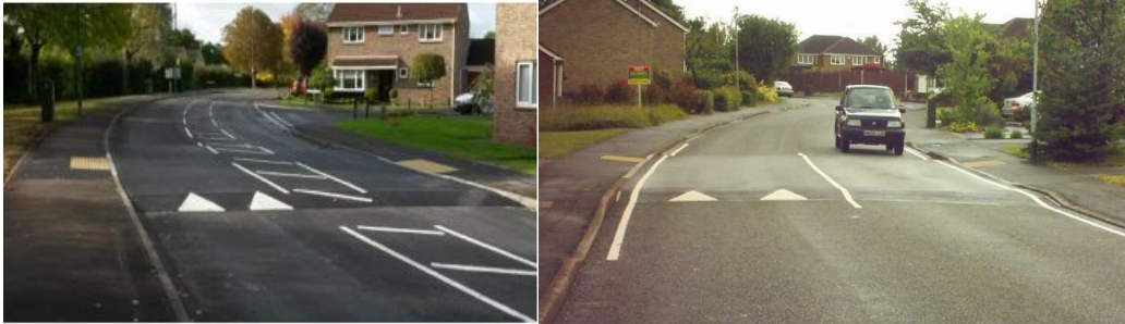
Photographs for illustration purposes only

In response to requests made by residents at this year's annual town meeting the Town Council has been liaising with the Highways Authority (North Yorkshire Council) to determine the feasibility of installing a safe crossing place on Market Place. The Highways Authority has determined that it would be possible to consider a "raised table crossing", which would slow traffic and provide a designated safe pedestrian crossing point.