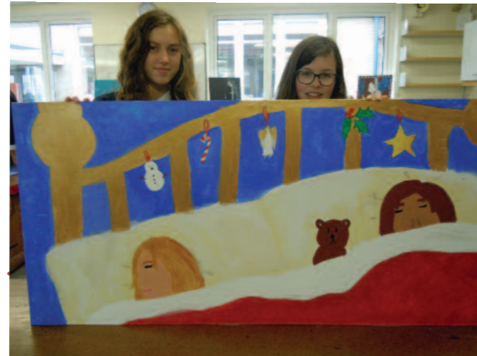
Students with their work for the Christmas Market boards

By invitation from Kirkbymoorside Town Council the students at Ryedale School have been working really hard