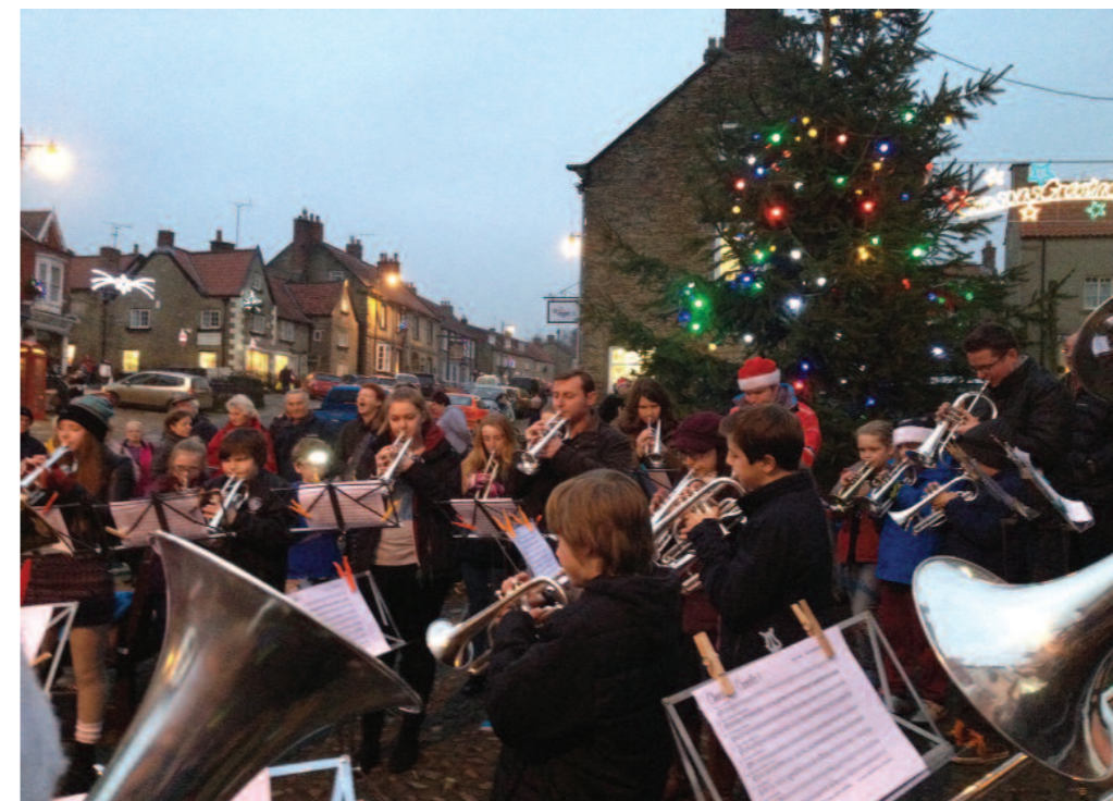
The Kirkbymoorside Band playing Christmas carols in the Market Place last year

This year the Christmas Market will be held on Saturday 28th November with over 30 food and craft stalls on the cobbles of the Market Place and in the Memorial Hall. In The Moorside Room there will be an exhibition by RJB Photographic entitled 'Northern Light'.