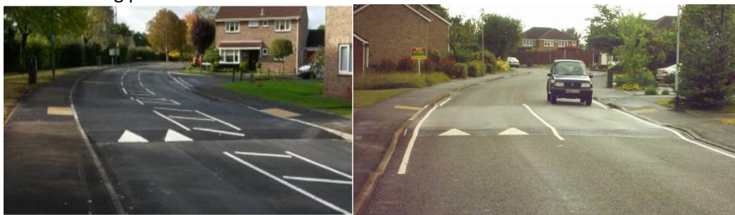
Photographs for illustration purposes only

the Town Council has been liaising with the Highways Authority (North Yorkshire Council) to determine the feasibility of installing a safe crossing place on Market Place. The Highways Authority has determined that it would be possible to consider a “raised table crossing”, which would slow traffic and provide a designated safe pedestrian crossing point.