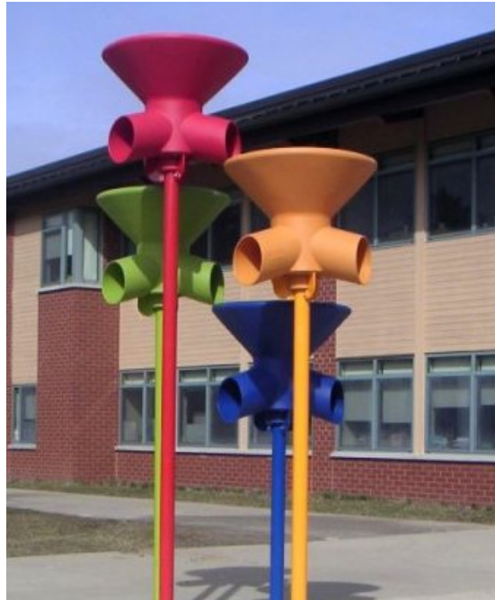
Example of additional hoop games, can be modified for wall mounting.