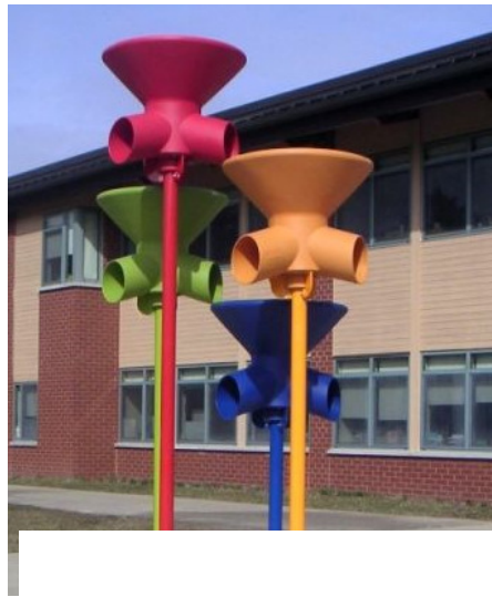
Example of additional hoop games, can be modified for wall mounting.