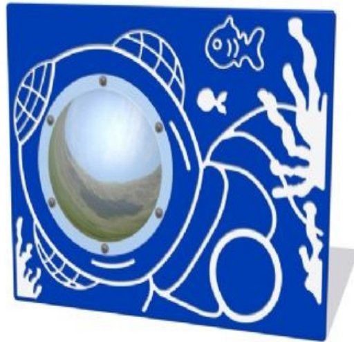
Example of educational panels. Designs can be custom made to fit the local area.