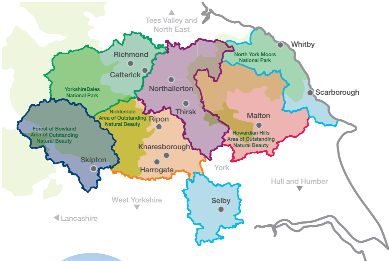
Proposed single council for North Yorkshire.

North Yorkshire's existing two-tier system showing the different areas covered by the seven district councils. The same area is also covered by one county council.